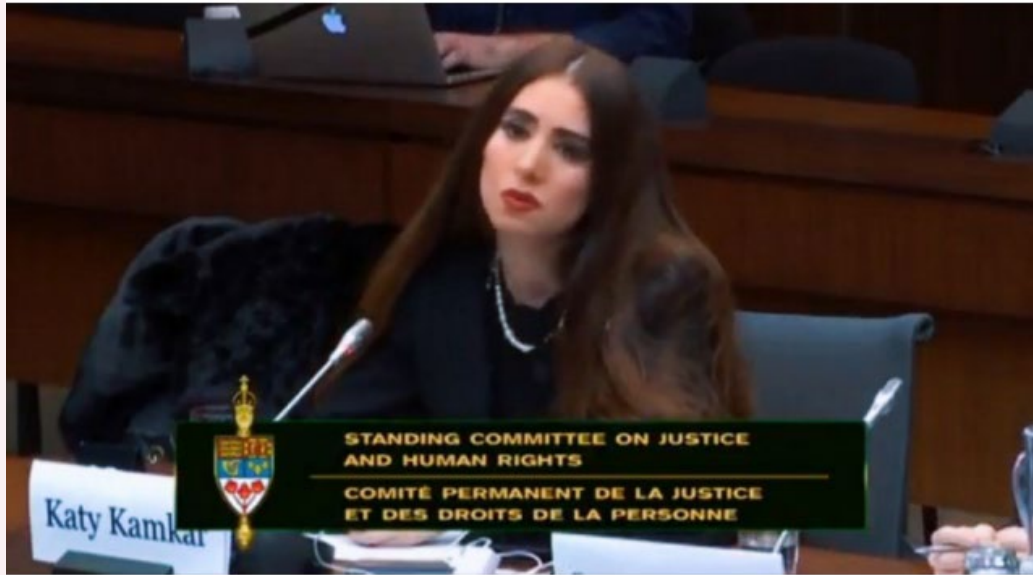
STANDING COMMITTEE ON JUSTICE AND HUMAN RIGHTS — HOUSE OF COMMONS OF CANADA